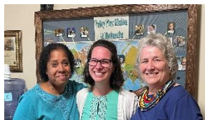
With friends after a meeting in Georgia